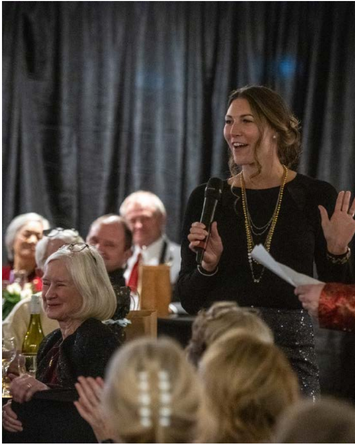
Proceeds from Celebrate the Season Gala Raise the Paddle directly support district programs and enrichment.