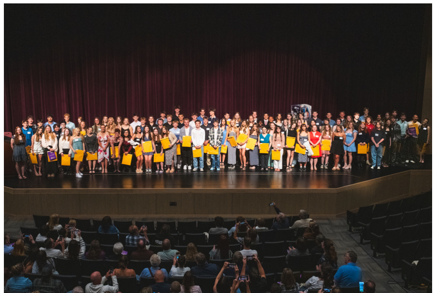
June 2025 scholarship ceremony.

Includes $67,250 for 2-year, Trade and Vocational Programs